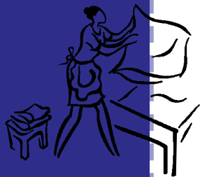
Amadora Fundraiser for St. Ann School

St. Ann School teachers are hosting a fundraiser which will kick off on Tuesday, August 23rd. The funds from the event will be used to assist with the purchase of Elmo's and digital projectors for each classroom. Funds will also be used to bring our library into the 21st century by purchasing a system for checking out books that will eliminate the ancient check out card system we now have in place.